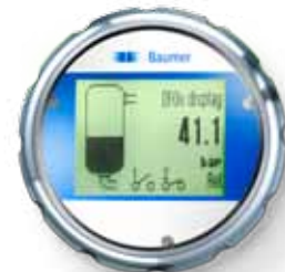
Tank visual (tank/bottle)