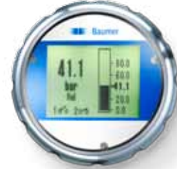
Bar graph (vertical/horizontal)