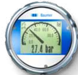
Analog (with/without value)