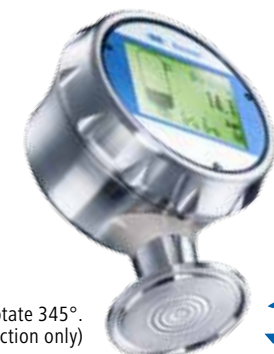
Connection can rotate 345° (bottom connection only)